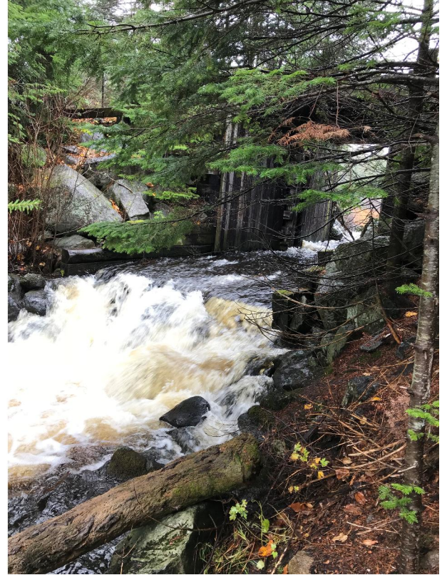
View of barrier at Nashwaak Lake

Regarding the Assessment of Tailings Management Alternatives (ATMA), comments included: