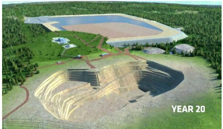
Model of Mine at 20 years (Northcliff Resources Ltd).

"...after taking into consideration the Comprehensive Study Report and taking into account the implementation of appropriate mitigation measures, the authorities are of the opinion that the project is likely to cause significant adverse environmental effects that can be justified in the circumstances."